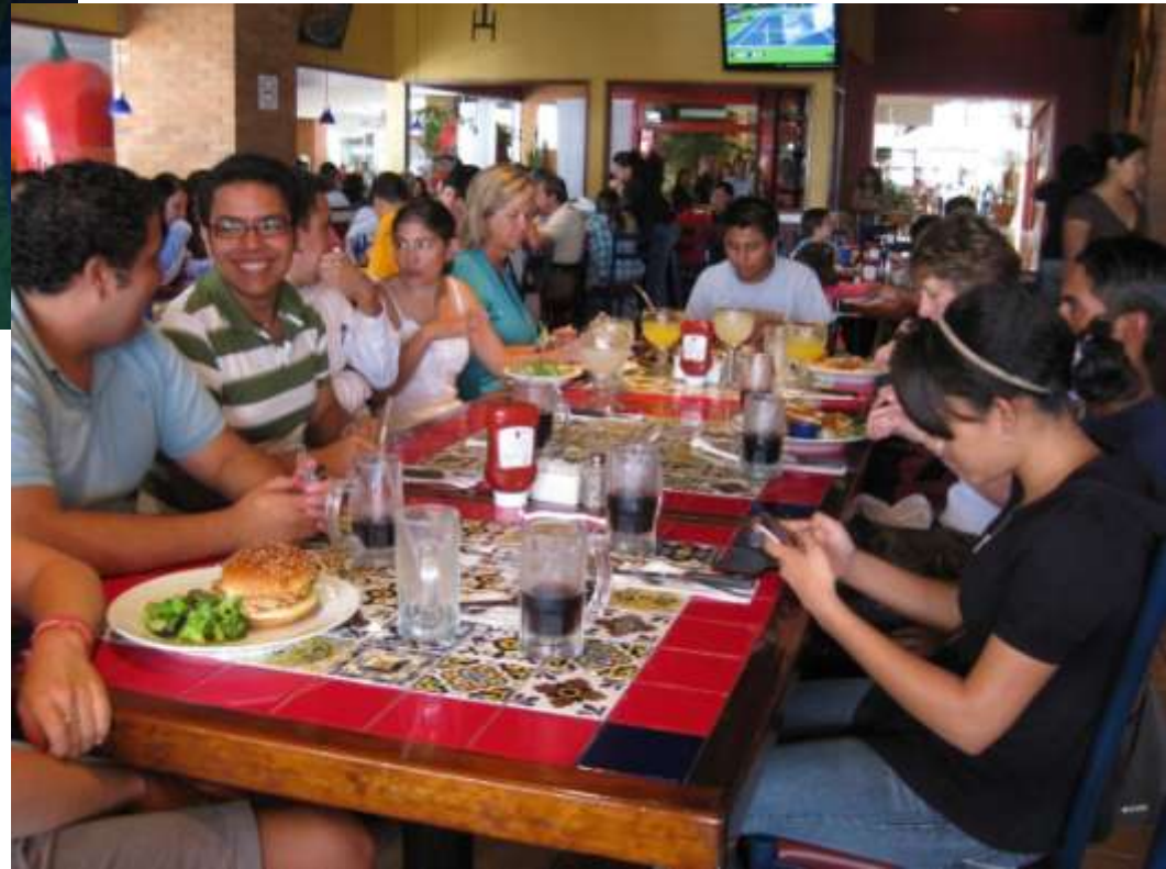
Lunch at Chilli's