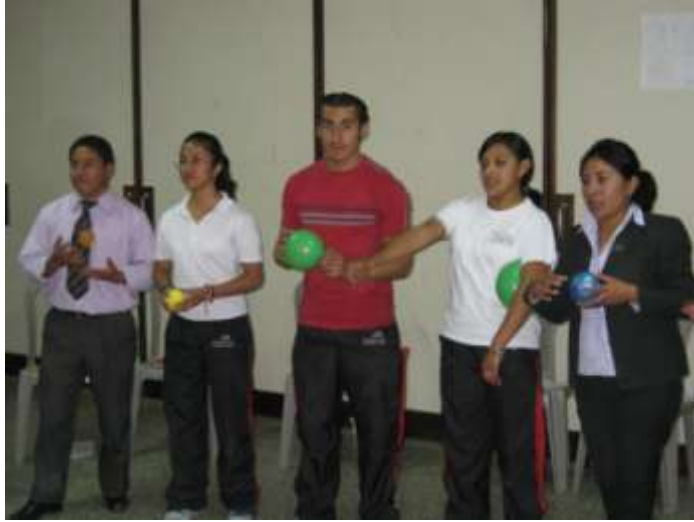
Workshop at a school Vida y Esperanza (Life and Hope) to 18 teachers