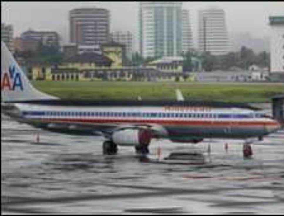
Guatemala City after Tropical storm Agatha