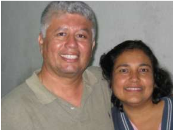
The leader and his wife

Visit to a Squatter's Village, City of Refuge, where we gave a workshop to 45 children and adults.