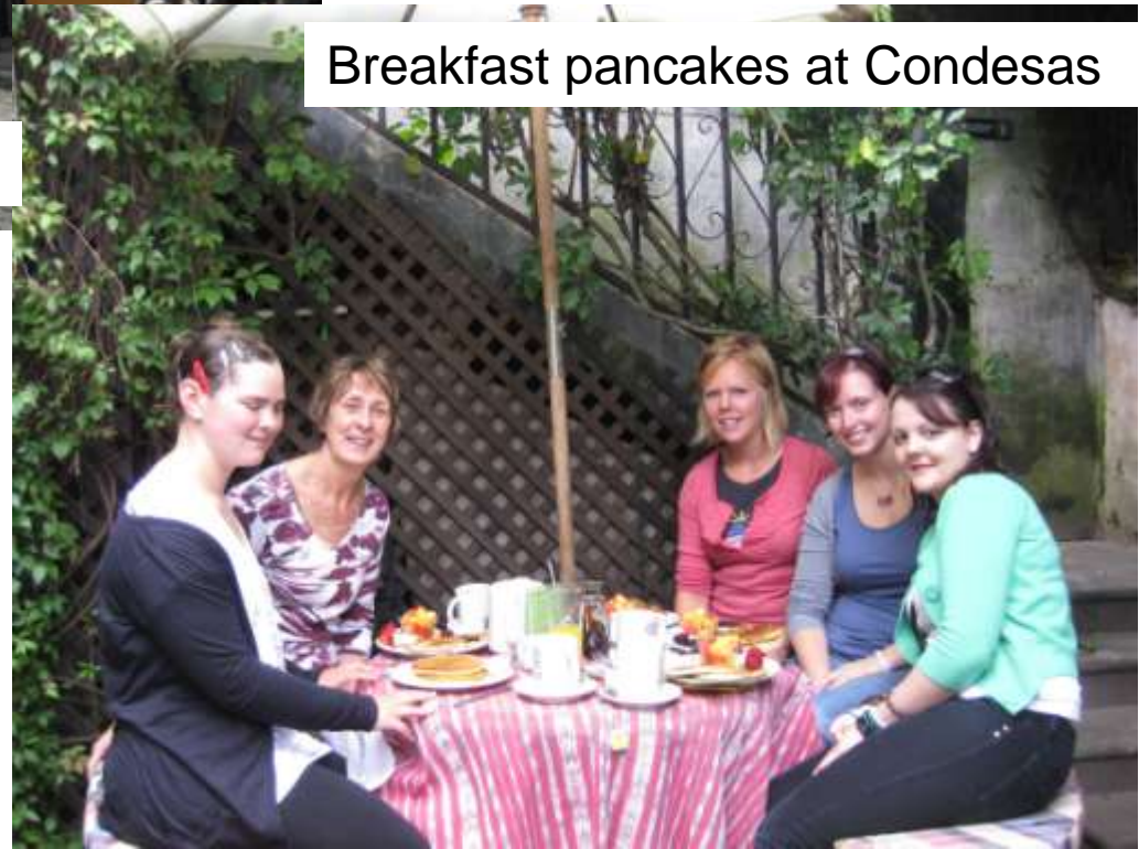
Breakfast pancakes at Condesas