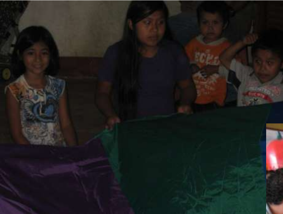
Workshop for 40 people at Hebron church