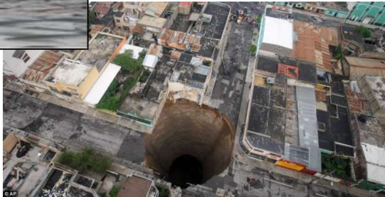
After volcano Pacaya erupted